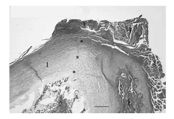
Fig. (2). Cross-section of a rat disc 3 weeks after disc puncture. The dorsolateral aspect of the disc is upwards in the picture. The dorsal surface of the disc is upper left and the ventral aspect is lower right. The annulus fibrosus (1) is surrounding the nucleus pulposus (2). A nodule (3) has been formed over the incision channel, which is indicated by asterisks. The nodule is just medial to the nerve root (4) and the psoas major muscle (5). (Bar 100\mu m ).

identified. The tissue was defined as granulation tissue before remodelling. These were consistent findings in all analysed specimens. The osteophytes comprised thickening of the cortical bone (Fig. 3).